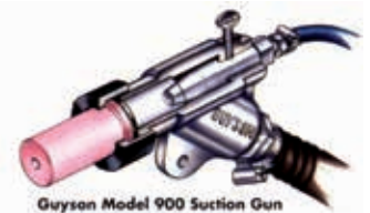
Guyson Model 900 Suction Gun