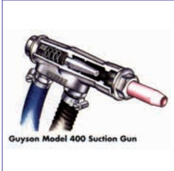
Guyson Model 400 Suction Gun